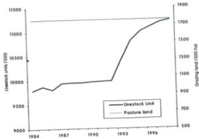
Figure 2.1 Trends of Livestock Units and Pasture Land

Land Degradation: Agricultural land is also affected by infrastructure development, industries and urbanisation. Many urban centres have been developed on fertile farmlands. Hill road construction has increased soil erosion and landslides. Its effect on farmlands is also significant. Laban (1979) estimated that about 5 per cent of the total landslides in Nepal are associated with road construction.